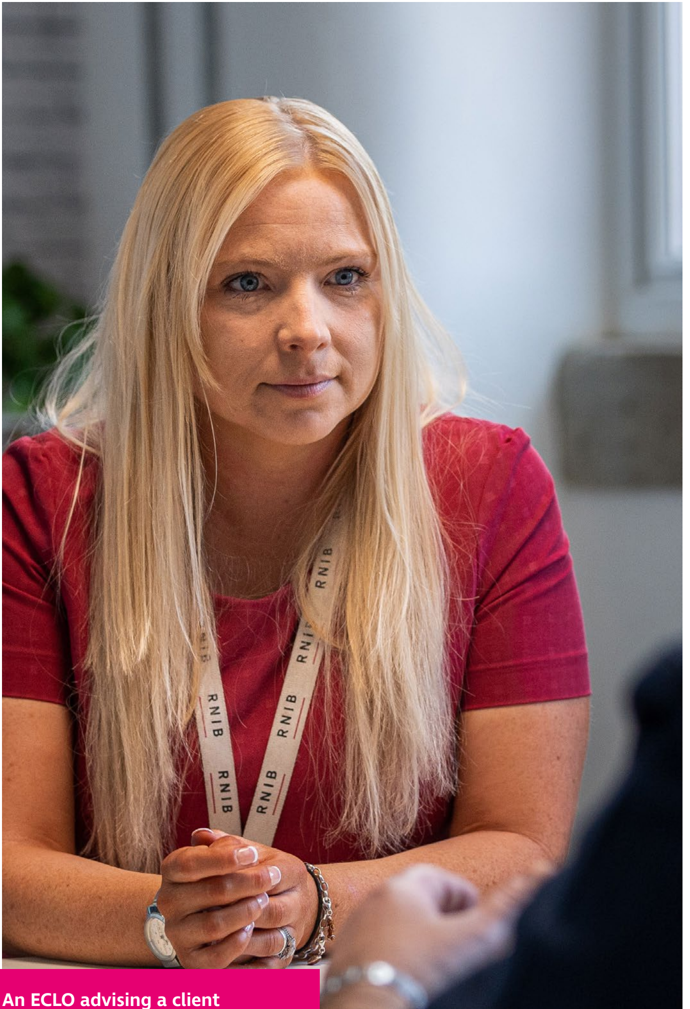
An ECLO advising a client