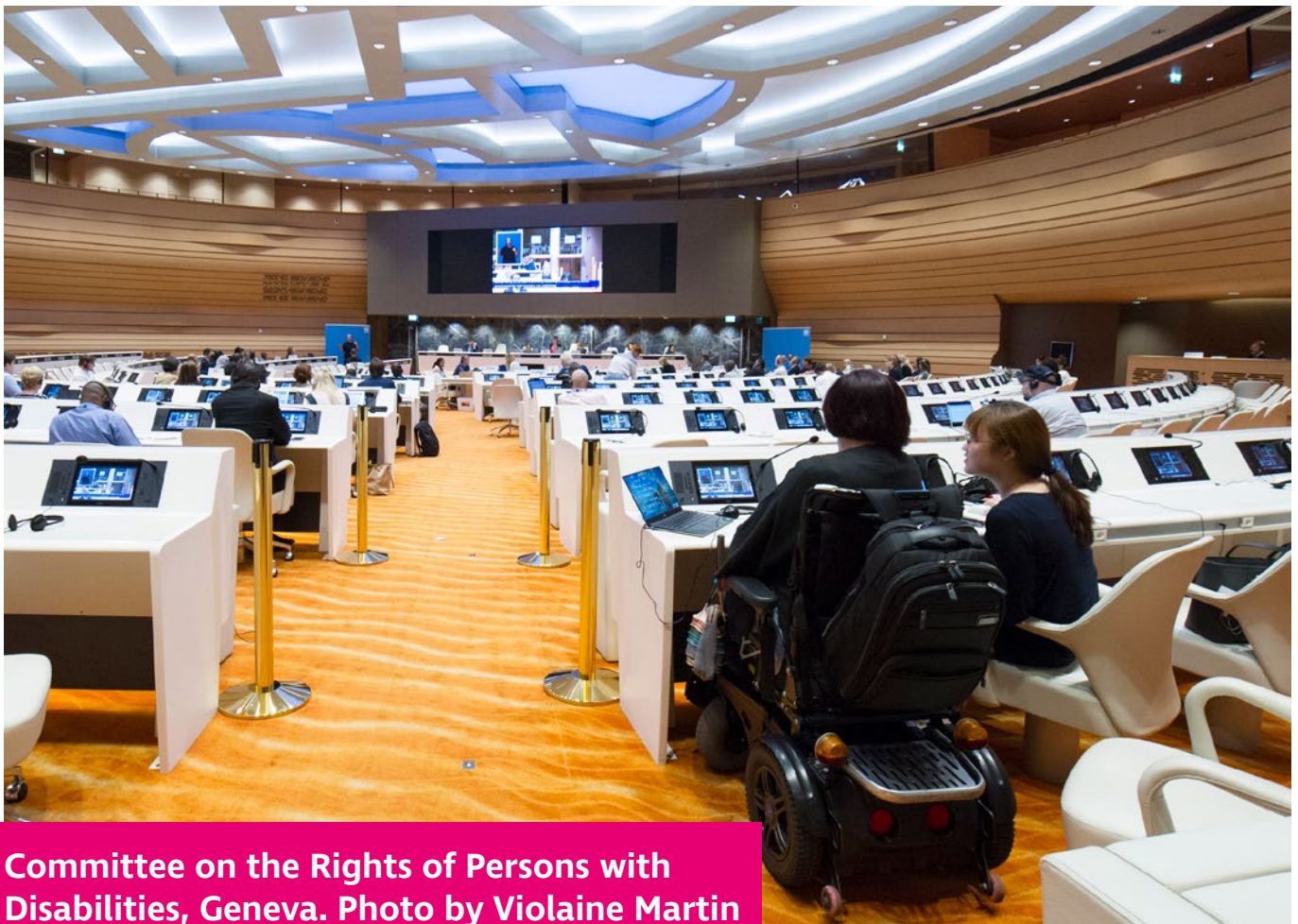
Committee on the Rights of Persons with Disabilities, Geneva.

The United Nations Committee on the Rights of Persons with Disabilities (the Committee) periodically monitors how well the UNCRPD is being put into practice in the countries that have signed up to it. In the most recent review of the UK (which includes the devolved governments of Wales, Scotland and Northern Ireland) the Committee raised concern that public services do not provide enough accessible information, and that legal standards for ensuring the accessibility of communications are insufficient ( bit.ly/3POS2XL ).